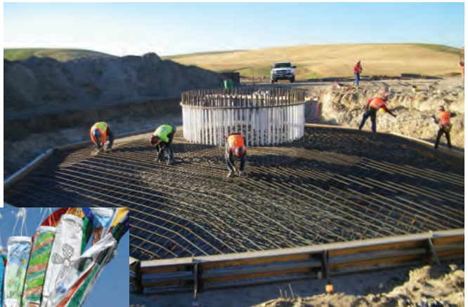
Workers (top) prepare to pour concrete foundation for new wind turbine.